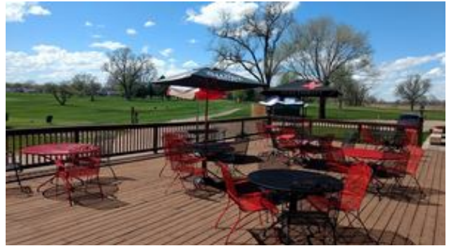
Another Round Sports Bar and Grill