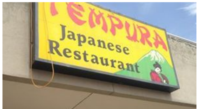
Tempura Japanese Restaurant