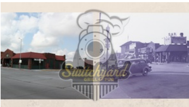
Switchyard Grill and Pub