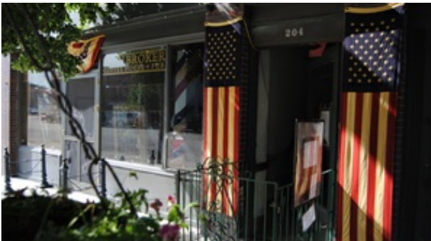
Bean Broker 2nd Street Coffee House & Pub