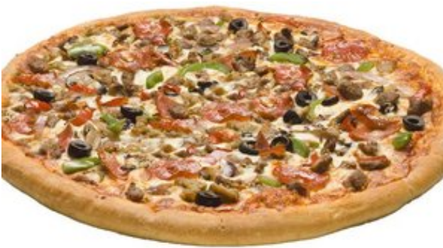
Donald's Hot Stuff Pizza