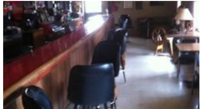
77 Longbranch Saloon