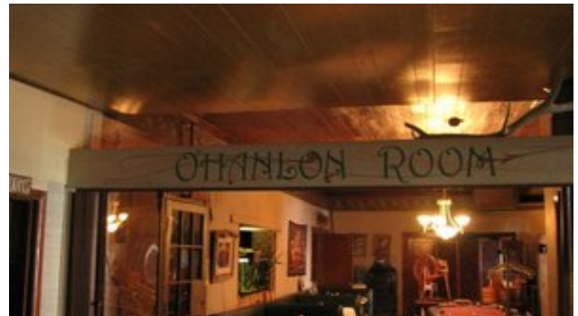
Olde Main Street Inn