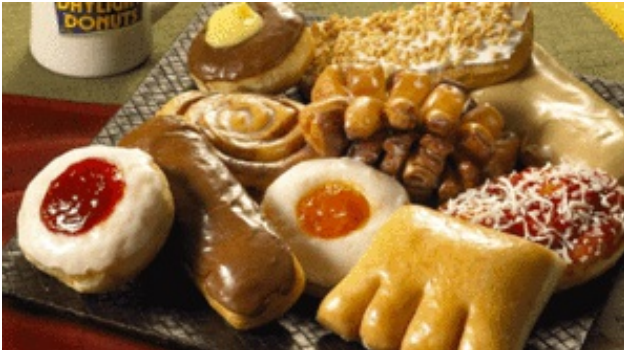
Daylight Donut Bakery