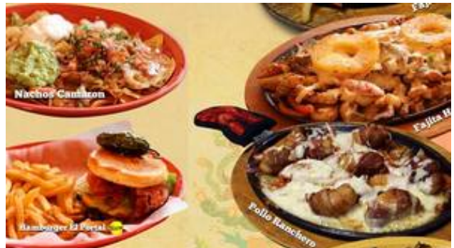
El Portal Mexican Restaurant