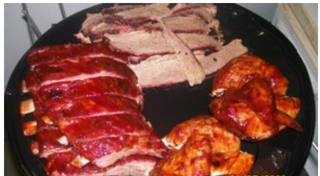
Hickory Road BBQ