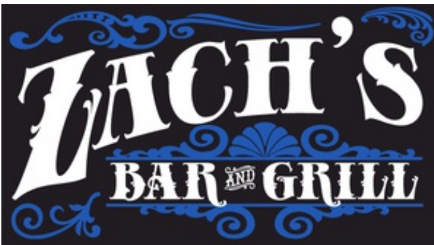
Zach's Bar & Grill