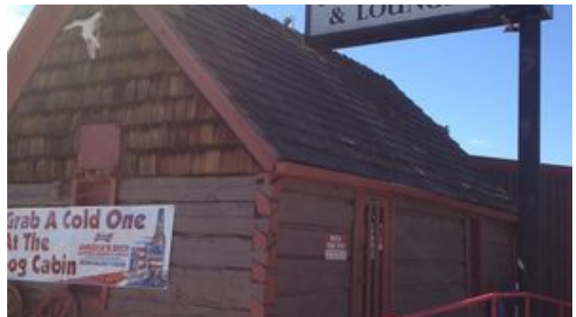
Log Cabin Restaurant & Lounge