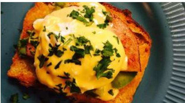
The Mixing Bowl