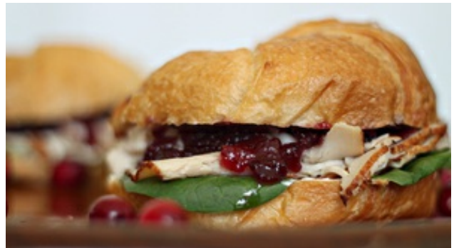
The Daily Grind Coffeehouse