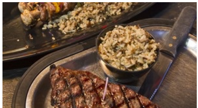
Steel Grill Restaurant & Bar