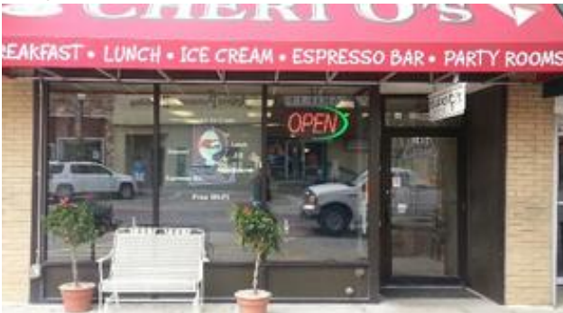
Cheri O's Coffee House and Ice Cream Parlour