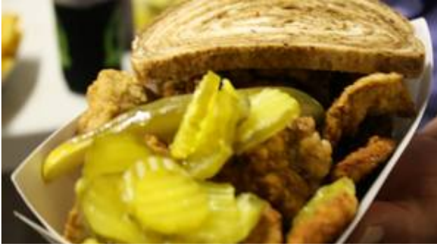
Round the Bend Steakhouse & Saloon