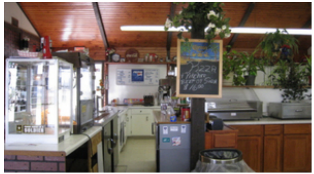
Pine Grove Rv Park & Campground