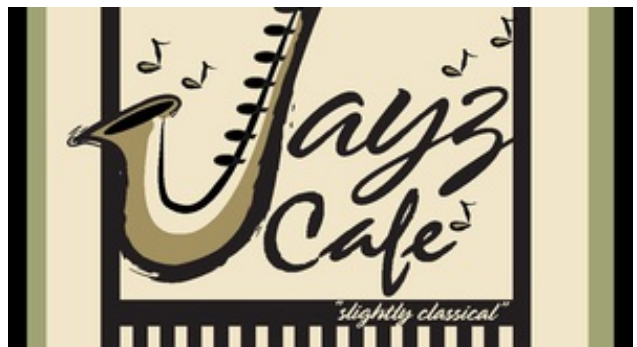
Jayz Cafe - Bakery Coffee Deli