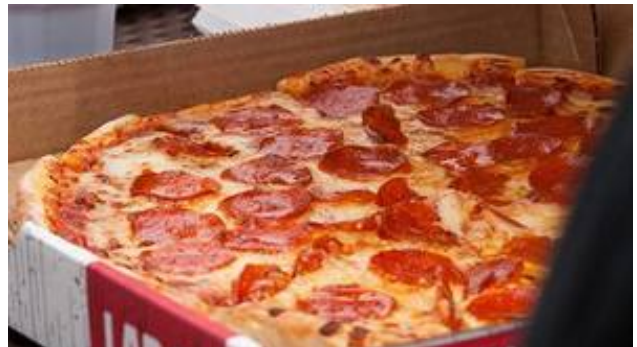
Casey's General Store