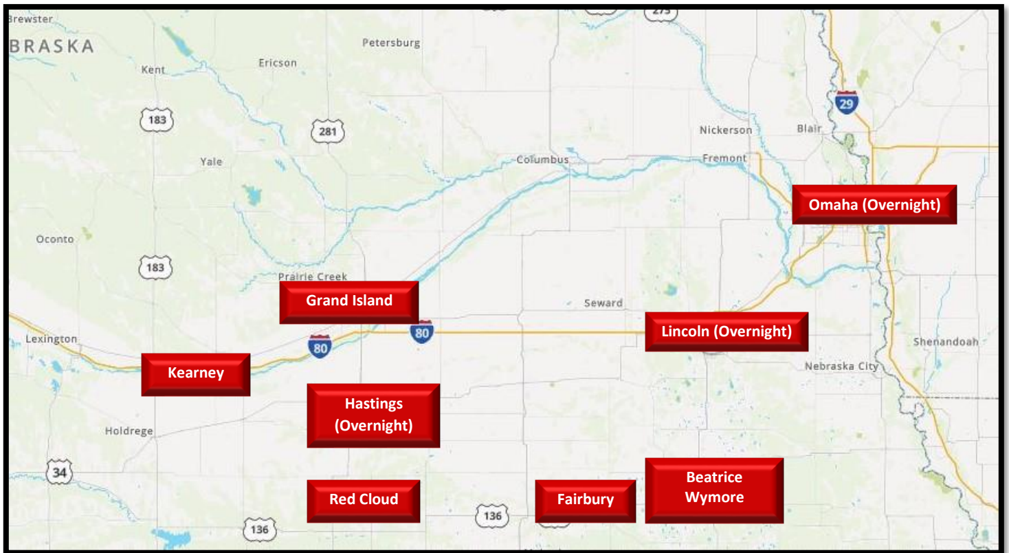
Tour Route Map (West)