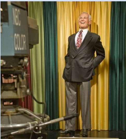
JOHNNY CARSON EXHIBIT AT ELKHORN VALLEY MUSEUM