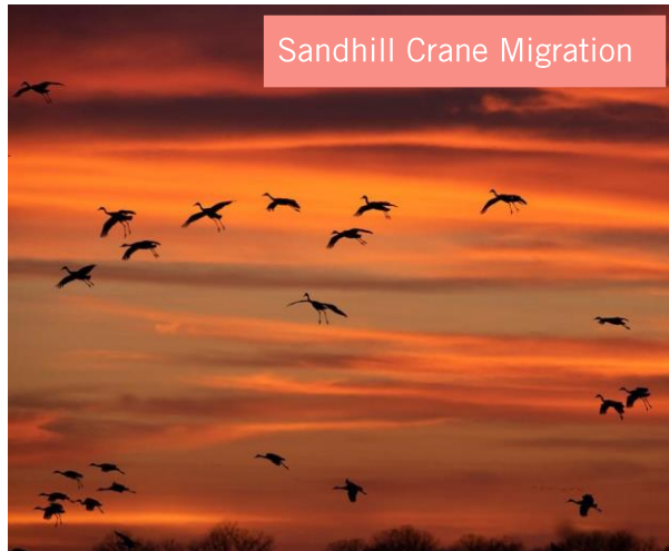
Sandhill Crane Migration

Now it is time to go back into the past at Stuhr Museum of the Prairie Pioneer where we start our exploration with a delicious lunch of fresh, homemade salads, sandwiches and more at Stuhr Bistro. Declared one of the top ten living history museums in the country, this amazing museum transports us back to the early pioneer and settlement days of Nebraska. We also will have an opportunity to go behind the scenes to see how the museum stores and catalogues its many acquisitions.