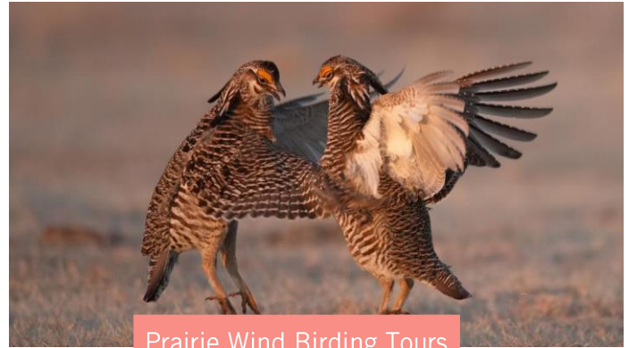
Prairie Wind Birding Tours

Our day starts with an early morning guided tour to view the fascinating prairie chicken mating dance with Prairie Wind Birding Tours and enjoy the sights and sounds as the males boom and dance to woo the females in the lek. We return to Kearney for a quick breakfast before heading to our next destination, Grand Island where our first stop will be Fred's Flying Circus . This whimsical, 3D art display is the creation of the late Fred Schritt and truly is a unique, "sky-high" art exhibit. Our next stop is The Chocolate Bar downtown for a cup of delicious coffee and to try some of their amazing chocolates before heading to Arts and Drafts to unleash our inner artist by creating our own sandhill crane painting.