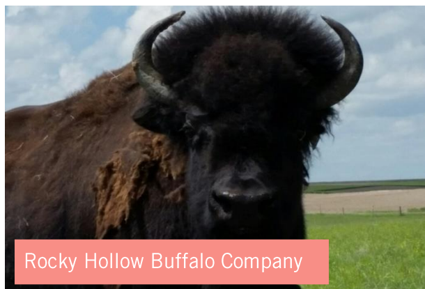
Rocky Hollow Buffalo Company

After lunch we start our tour of western Nebraska at EJE Ranch and learn about the High Plain's short grass prairie on a working ranch and the opportunity to venture out into the prairie to see this fragile ecosystem firsthand. Next, we head north along the Fossil Freeway (Highway 71) to Rocky Hollow Buffalo Company . This working ranch raises grass fed bison and you will have the unique opportunity to view these majestic animals up-close and learn how they have thrived for thousands of years in western Nebraska's High Plains region. We end our day with dinner at Steel Grill in Gering. Make sure to order their signature steak nachos. Overnight: Gering