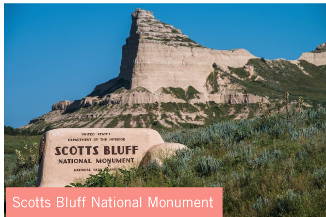
Scotts Bluff National Monument

Once we return to Gering, we head to Legacy of the Plains for an authentic wagon train dinner. While there we can hear more about the lives and stories of the people who explored and settled the High Plains of Nebraska. Exhibits focus on the archeology of Native American and Westward expansions, the lives of pioneering settlers, the establishment of irrigation, the diversity of cultures on the High Plains, and the innovative technologies and cultural practices of raising animals and crops in a semi-arid environment. Overnight: Gering