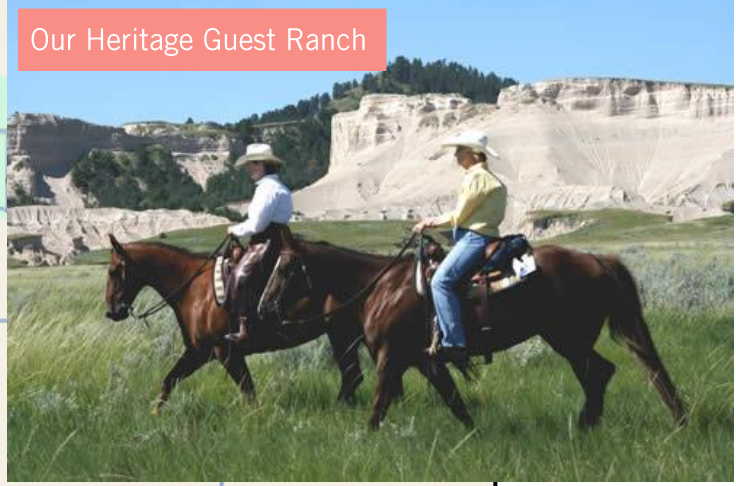
Our Heritage Guest Ranch

Drive time from Denver to Kimball: 2 hrs. 15 mins.