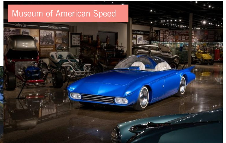
Museum of American Speed