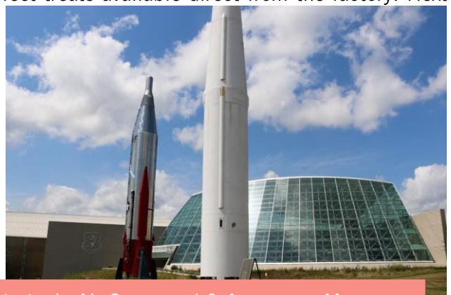
Strategic Air Command & Aerospace Museum

After lunch, we make our way to Larsen Tractor Test Museum on the University of Nebraska East Campus to visit the only tractor testing museum and tractor test laboratory in the world. On display are more than 25 tractors highlighting the advancements in tractor testing technology, which established power and performance standards and solved agricultural problems around the world. While on campus,