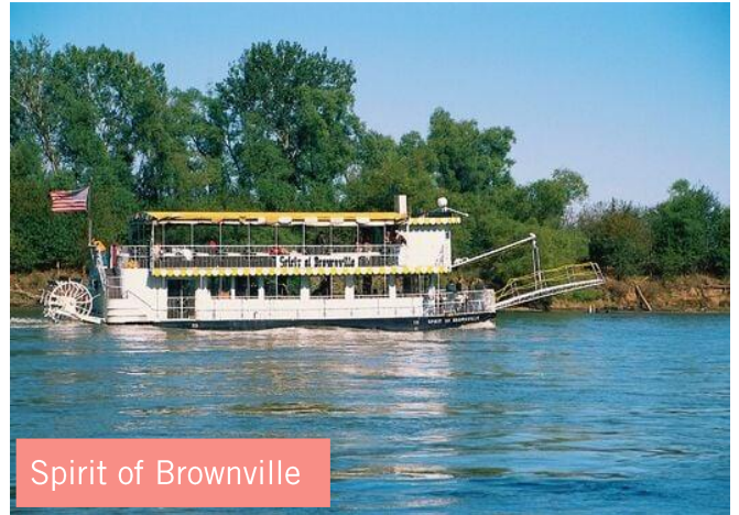
Spirit of Brownville