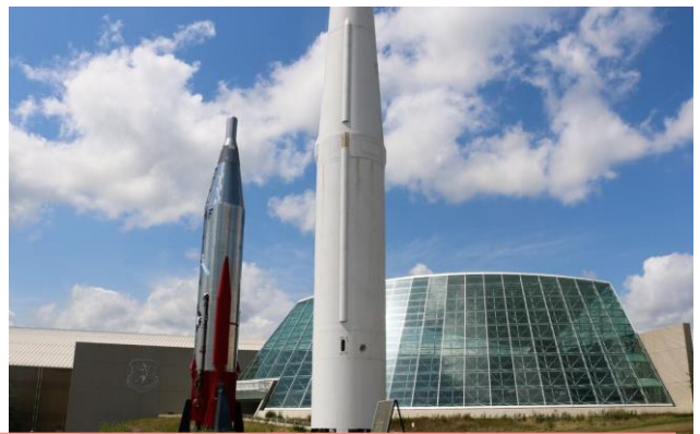
Strategic Air Command & Aerospace Museum

We round out our day in Lincoln, Nebraska's capital city, where our first stop is at one of the city's most interesting and fascinating places, Robber's Cave where we learn more about the cave's storied past and colorful characters from an experienced guide. Afterward, we head to the Historic Haymarket District for dinner and entertainment at Screamer's Dining & Cabaret where we dine on delicious homemade fare while the restaurant's talented staff entertain us with songs and laughter. Overnight: Lincoln