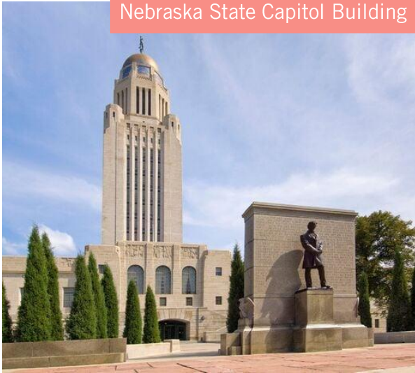
Nebraska State Capitol Building