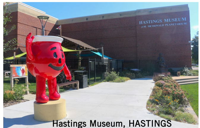
Hastings Museum, HASTINGS

Now we head to North Platte’s historic Canteen District for a special ice cream donut sandwich, waffle sundae, or other tasty concoction at Double Dips Ice Creamery . Before departure, our final stop in town is Fort Cody Trading Post , one of Nebraska’s most eclectic gift and souvenir shops. Do not miss the working 20,000-piece miniature