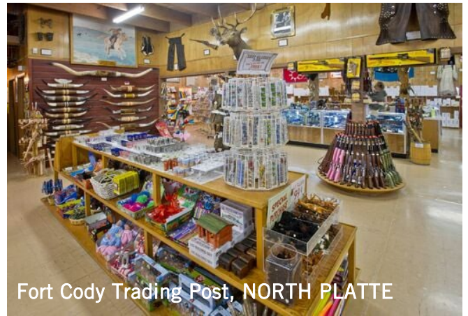
Fort Cody Trading Post, NORTH PLATTE

Next on our tour is the Golden Spike Tower . Rising 8-stories above the tracks, the tower offers a panoramic view of Union Pacific's Bailey Yard, the largest classification rail yard in the world, from an open-air platform or enclosed viewing area. Over 10,000 rail cars pass through Bailey Yard each day, and you can see it all from your bird's eye view atop the tower. Now imagine having a private catered meal served on the 8 th floor as the sun sets over the railyard. This is truly an experience you do not want to miss. Overnight: Kearney