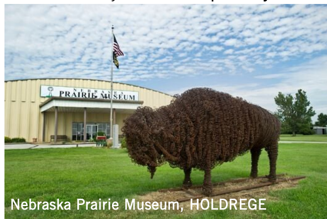
Nebraska Prairie Museum, HOLDREGE

Depending on the time of year, a guided wildlife tour at Funk Peterson Wildlife Trail is available and a great way to become better acquainted with the wildlife and birds of this important watershed area. Before dinner we make a stop at Lost Way Brewery to sample their amazing hand-crafted beers and root beer. Afterward it is time for a true Nebraska culinary treat at The Speakeasy where we