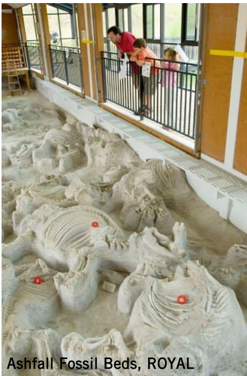
Ashfall Fossil Beds, ROYAL